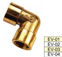
EV-01 EV-02 EV-03 EV-04