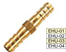
EHU-01 EHU-02 EHU-03 EHU-04