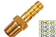
EHC-01 EHC-02 EHC-03 EHC-04