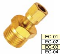
EC-01 EC-02 EC-03 EC-04