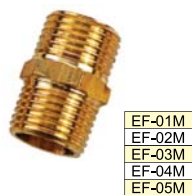
EF-01M EF-02M EF-03M EF-04M EF-05M