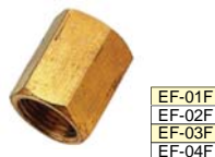
EF-01F EF-02F EF-03F EF-04F