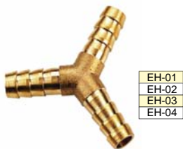
EH-01 EH-02 EH-03 EH-04